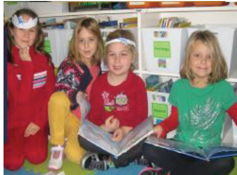
Literacy for low income and migrant children in Washington broaden horizons.

the Projects tab at www.dkegef.org . The next application date for projects is January 3, 2015.