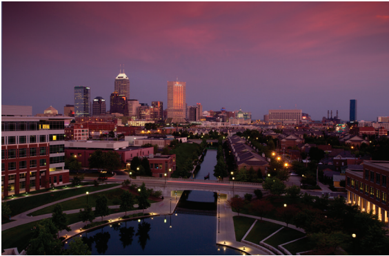
Downtown Indianapolis skyline from the north end of the Central Canal.

explorations of common core standards and STEM (Science, Technology, Engineering and Mathematics), academic studies regarding pedagogy and successful instructional models, development of technology skills for personal and professional use, methods for impacting legislative policy and educational law, assistance in exploring online education opportunities