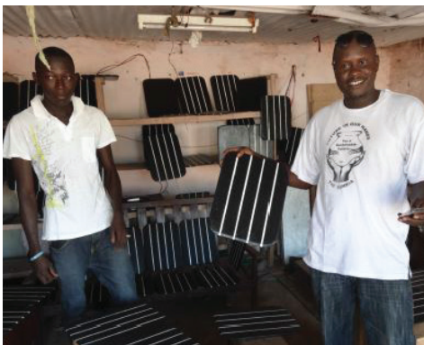
Reading Skills Project provides slates and chalk for school children in Gambia to learn reading and mathematics.

Renewed projects for 2014-2015 include Teaching Finnish Language and Institutions to Migrant Women , Finland; Helping Homeless Students Succeed in College , Wisconsin; My 2nd time Around—An Adult Learner's Mathematical Journey , Ohio; Reading Skills Project in Gambia , Sweden; and Environmental Appreciation , Washington. A complete list of new and renewed projects, recipients and amount of award can be found under