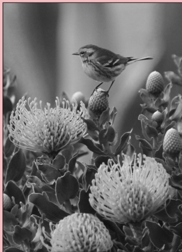
Colorful Perch